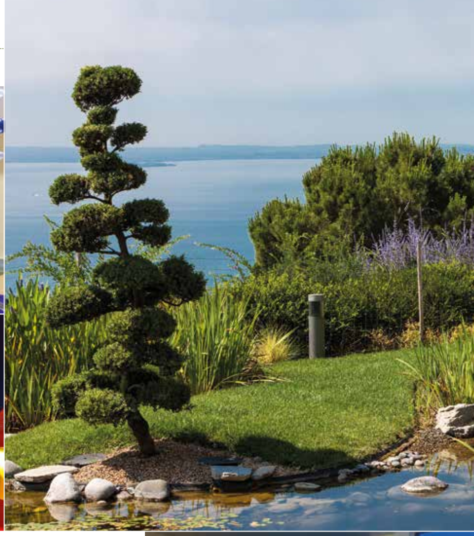
Clockwise from top: The reception area is a hub through which all guests must pass to reach their suites; treatments can be taken in the Zen Garden gazebo; couples can get back to the elements in a private spa; atmospheric immersion in Lefay's indoor pool; the opulent sauna interior