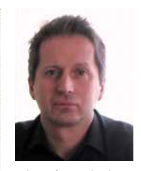
"The Lefay Method treatments now account for 80% of our treatment revenue. It makes us unique and gives us something different to offer"