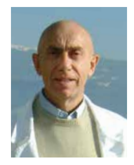
"We really wanted to create something far beyond the typical wellness offer - a unique concept to deliver health through awareness"