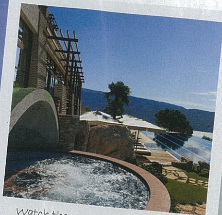
Watch the sun set from the stunning thalassotherapy pool

There are three areas: Fire & Water, with indoor and outdoor salt-water swimming pools, an infinity pool, five saunas, a salt-water lake and relaxation areas; Nature & Fitness – the gym and exercise studio – and Silence Between the Stars, with outdoor running circuit, fitness path and energy gardens. We started each morning swimming laps in the sleek 25-metre lap pool as the sun rose over Lake Garda and ended each day in the bubbling outdoor thalassotherapy pool watching the sun set behind the mountains.