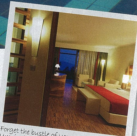
Forget the bustle of your normal life and unwind in the spacious accommodation

THE SPA: The heart of the resort, Lefay's spa is somewhere you can happily while away the days.