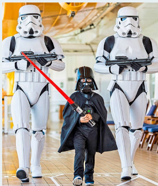
FEELING THE FORCE: Jedi training

A HOLIDAY is a fantasy – the chance to be someone else, somewhere else for a blink of time. A Disney cruise is a double fantasy, a true land of make-believe, where children can hug Snow White and grown-ups can talk to turtles.