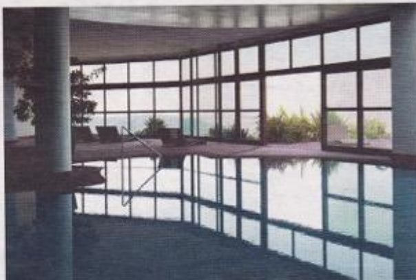
BELOW The resort faces south to make the most of views over the lake

the the resort's heating – and 100% of its cooling and air conditioning – comes from renewable energy. All electricity is from renewables – 60% of which is generated on site.