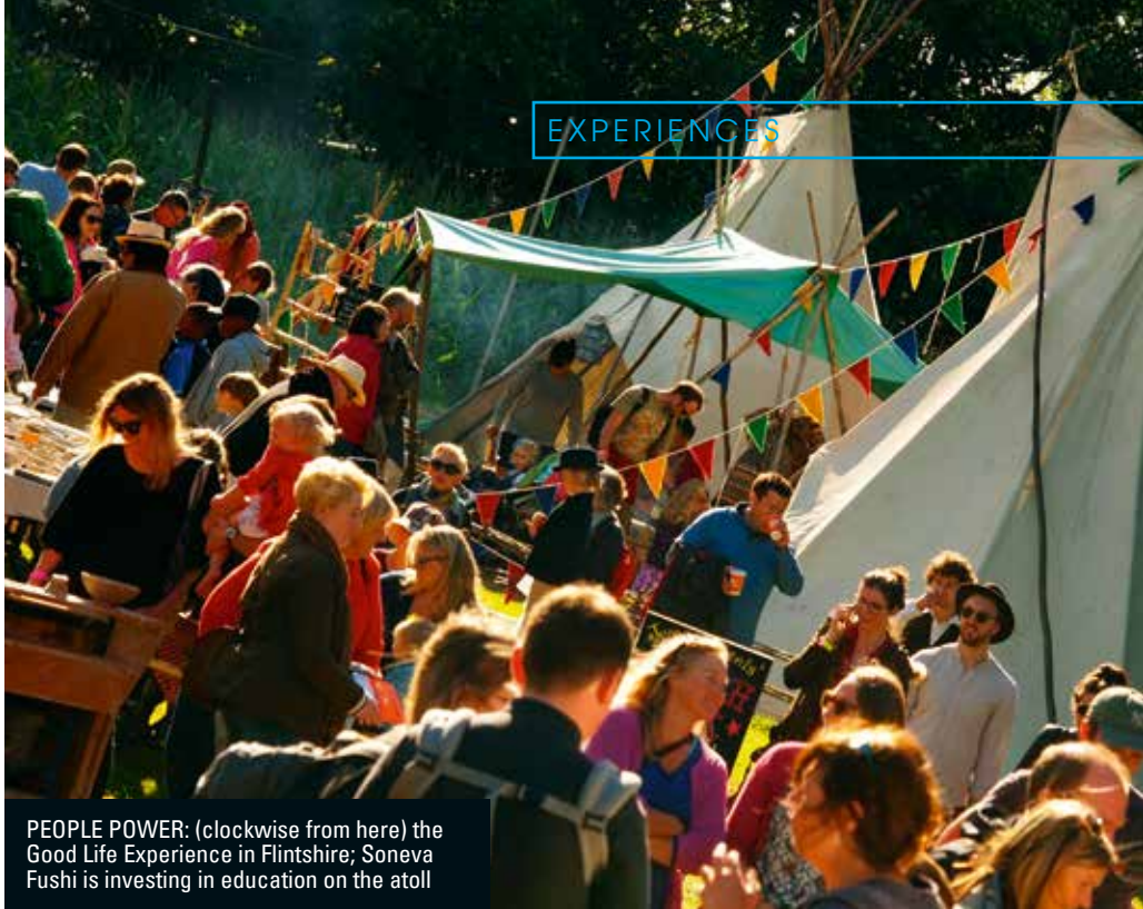
PEOPLE POWER: (clockwise from here) the Good Life Experience in Flintshire; Soneva Fushi is investing in education on the atoll