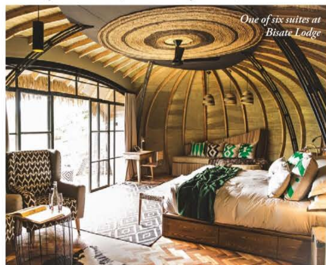
One of six suites at Bisate Lodge

Like giant birds' nests built around a natural amphitheatre of eroded volcanic cone, the six pods that make up Bisate Lodge are breathtaking – literally. The air up here is rarefied (suite six is perched at a puff-inducing 2,650m) and, once inside, one gasps at the swooping ceiling and dried-grass walls of the thatched villas, which are inspired by the former royal palace of Nyanza. Floor-to-ceiling windows frame views of Bisoke and Karisimbi volcanoes, where Dian Fossey studied the gorillas 'so high up that you shiver more than sweat'. There's no need to shiver in the cosy interior, where an open fire separates the spacious bedroom from the bathroom with its oval black resin tub. Dine à deux here, or walk down to the main lodge for exceptional farm-to-table food. And when the time comes to check out those magnificent mountain gorillas, there's a kit room to ensure everyone is properly equipped. Double, from £2,670 ( wilderness-safaris.com ).