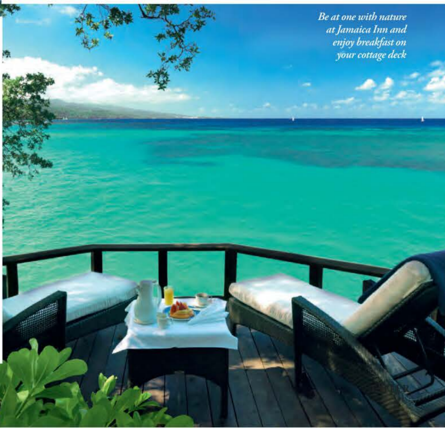
Be at one with nature at Jamaica Inn and enjoy breakfast on your cottage deck

For a change from the revered Lake Garda LeFay, try its younger Alpine sister, where glamour is elevated to dizzying heights – you can't move on the terrace for chic Europeans sporting this season's Moncler. The spa, more than 53,000 square feet of earthy, elemental energy, is also a crowd-puller. Less doctor-led than its older sibling, its focus is on the natural world, and treatments fold in Alpine butter, horse chestnut and mountain flowers. There are five 'sensory circuits', inspired by the seasons, whose areas differ in temperature as well as treatments and types of phytotherapy (healing with active plant ingredients). The former range from ice fountains and salt inhalations to bio-saunas and potassium-enriched pools. Meanwhile, the Michelin-featured Grual restaurant is a destination in its own right. After, say, saddle of roe deer and cherries, and iced green-apple meringue, sleep comes easily. Especially if you've booked the penthouse, with its bubbling hot tub, private sauna and head-spinning views. Elegant Resorts (elegantresorts.co.uk) offers seven nights from £1,755, including flights and transfers.