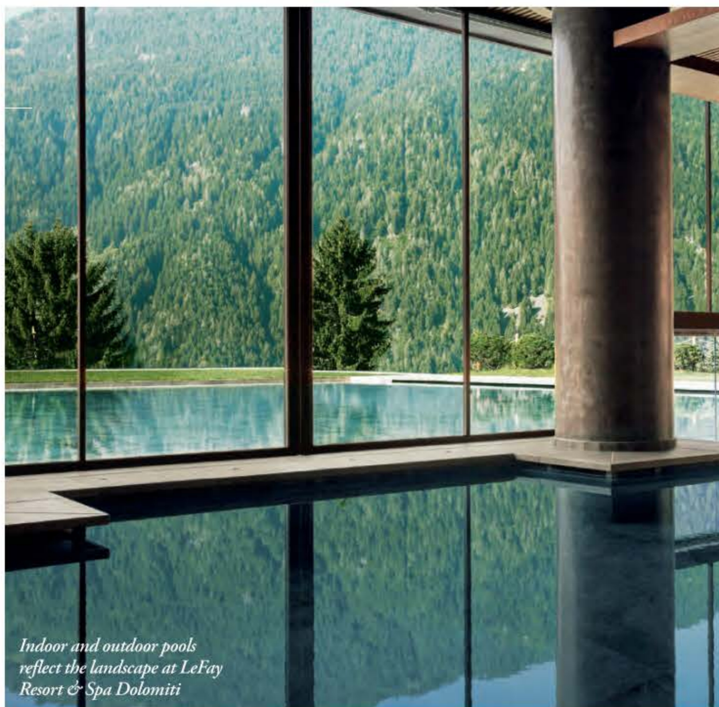
Indoor and outdoor pools reflect the landscape at LeFay Resort & Spa Dolomiti